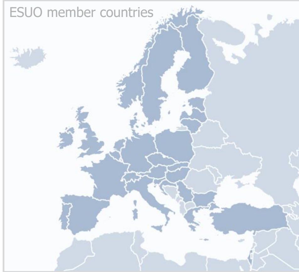
map adapted from www.wayforlight.eu/eng/esuo.aspx *